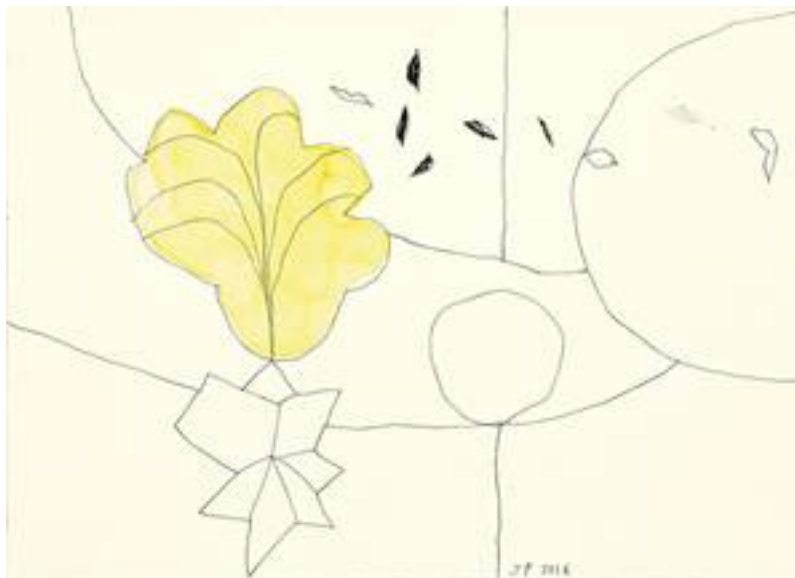
Azure Crystal , 2016, 100 Poets, Federico Garcia Lorca Watercolor, pencil on paper, 27 x 33 cm

Eröffnung der Ausstellung: Mittwoch, den 26. September 2018, 19.00 Uhr 26. September bis 17. November 2018